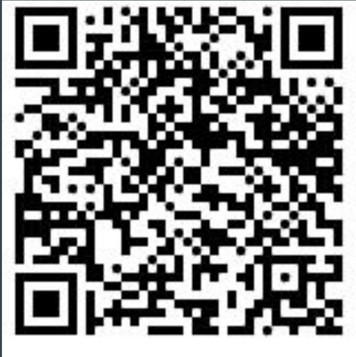
Example Resolution Paper